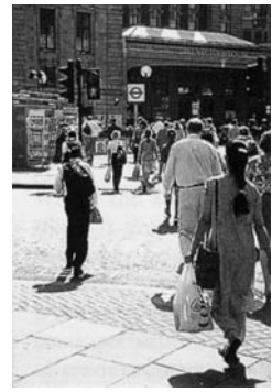
Pedestrian crossing facilities at traffic signal controlled junctions are covered in TA15 (1) .