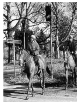
When considering a crossing for equestrians, cyclists and/or pedestrians, then the general references to pedestrians in this document can be read to include all groups. However, only pedestrians may use pedestrian crossings.