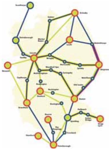
MAP OF INTERCONNECT SERVICES

Through the proposed network illustrated on the diagram below, the company has an aspiration to link all its market towns and service centres. Full implementation of the InterConnect strategy across Lincolnshire will enable this to happen.